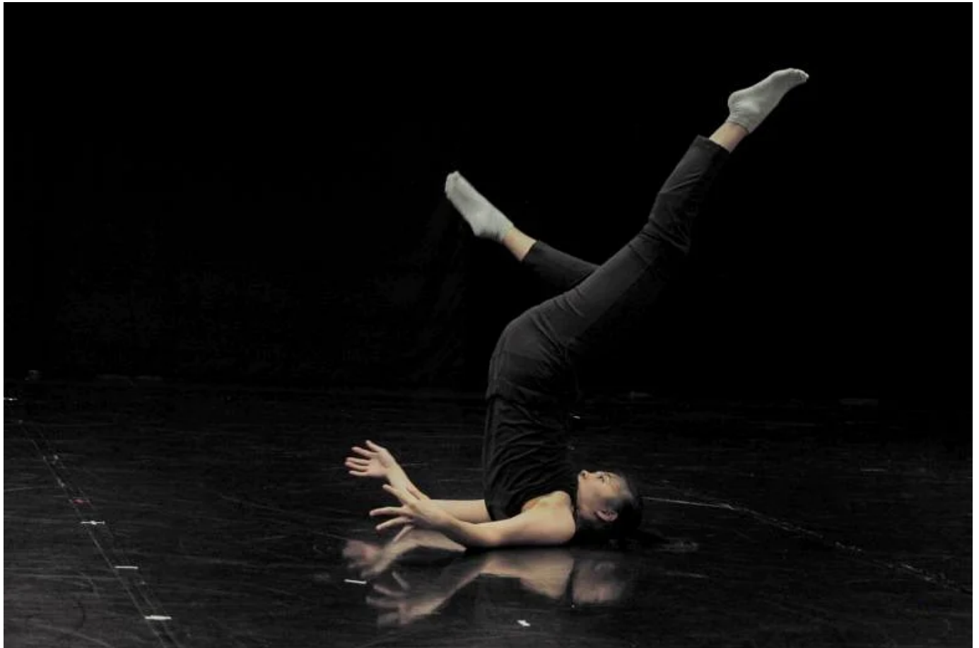
A rehearsal of More Than Human by Shahar Binyamini for Frontier Danceland's showcase Sides .