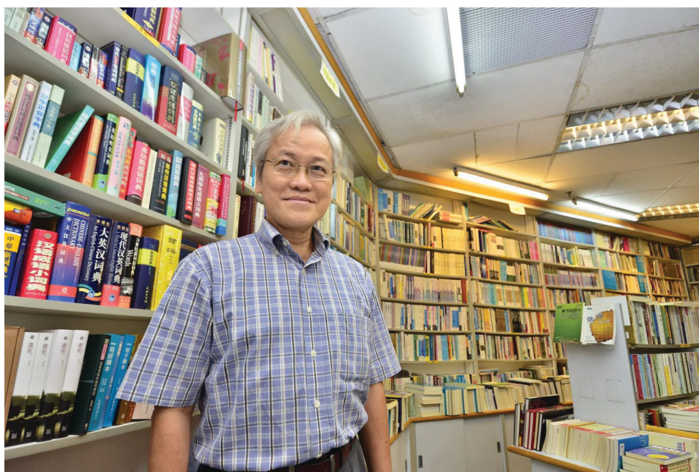
The late writer Yeng Pway Ngon in his bookstore Grassroots Book Room in 2012.

On Jan 10 last year, Yeng Pway Ngon, one of Singapore's most eminent Chinese-language writers, died after a long battle with cancer.