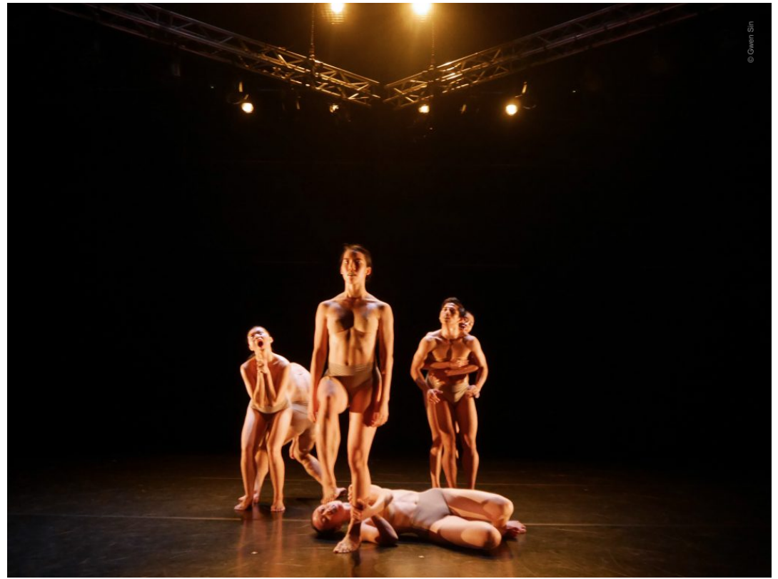
Wet Ostrich by Shahar Binyamini (Israel)

Catch SIDES 2019 premiering on May 10, 2019 through May 11, 2019. Tickets are still on sale at www.sistic.com.sg. There will also be post-show dialogues for both shows on May 11, 2019.