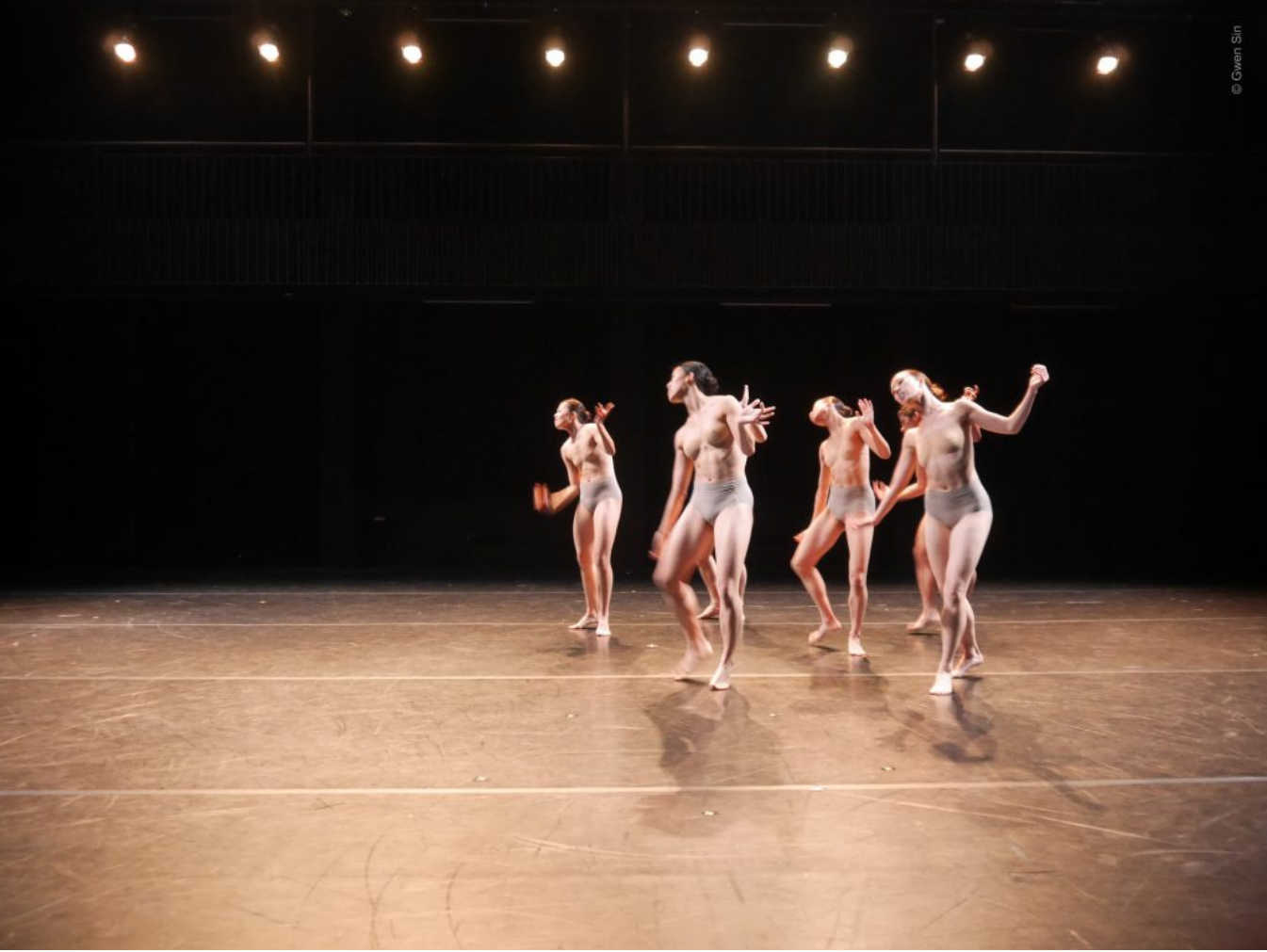
Wet Ostrich by Shahar Binyamini (Israel)