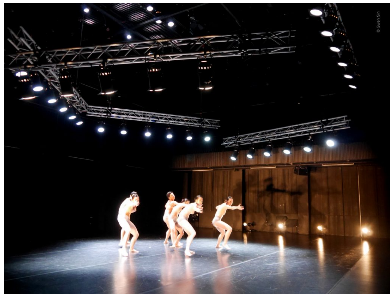
Wet Ostrich by Shahar Binyamini (Israel)