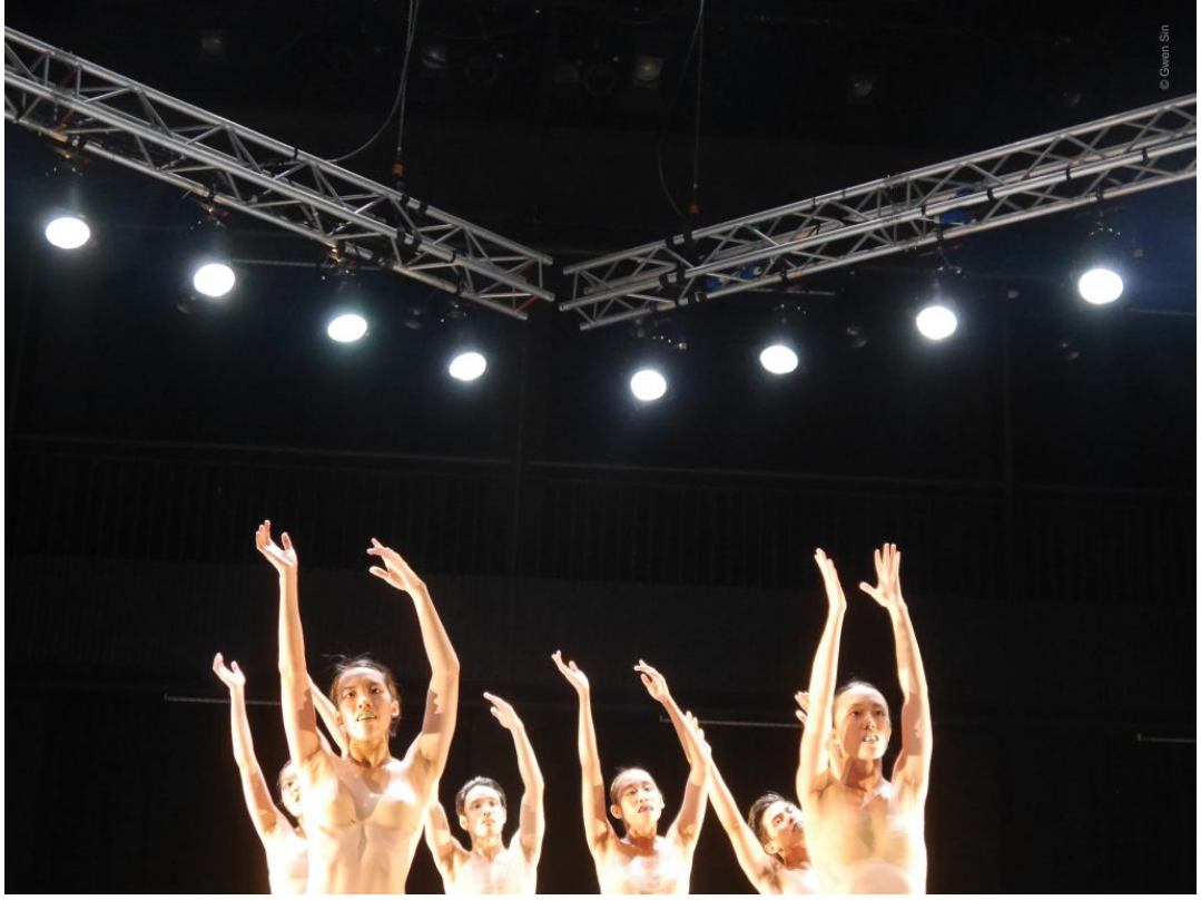
Wet Ostrich by Shahar Binyamini (Israel)